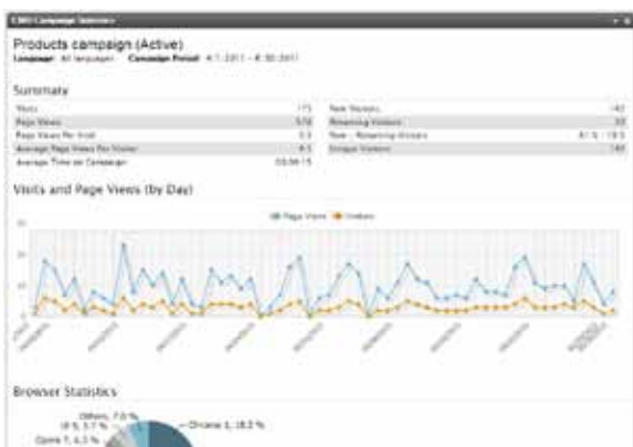
CMO Campaign statistics gadget showing how your campaign is performing

Any marketer knows that one of the pillars for a marketing initiative to be worthy of being called a campaign is that the results can be tested and measured. Preferably the campaign can be adapted in real time to ensure that the desired ROI is achieved. Most marketers would also agree that testing and monitoring campaigns are often too complex and too hard to fit into their daily marketing workflow. With EPiServer Campaign Monitor and Optimization (CMO) you can easily measure and monitor online campaigns and optimize your landing pages.